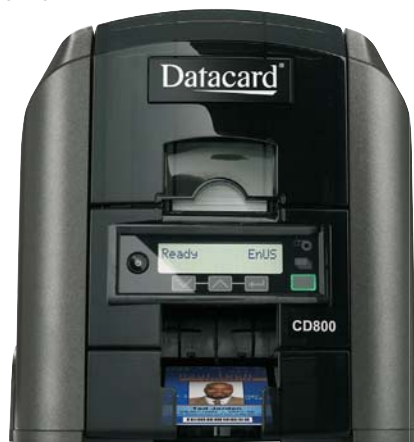
Datacard CD800 Card Printer