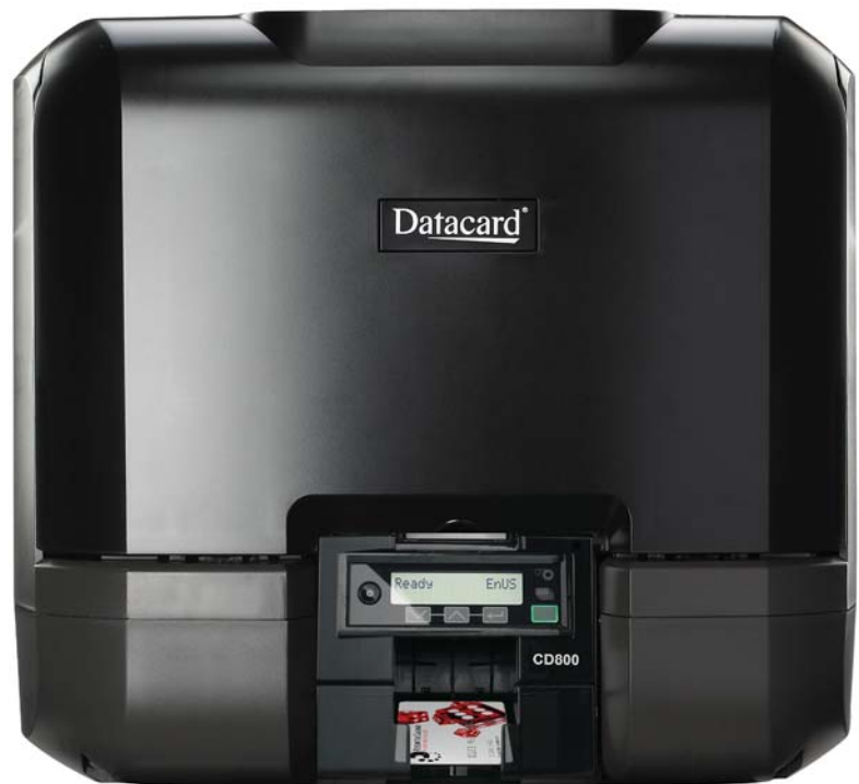
Datacard CD800 Card Printer with optional multi-hopper