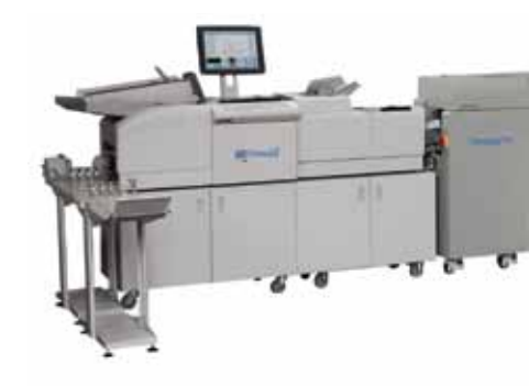
Datacard<sup>®</sup> MXi<sup>™</sup> envelope insertion system