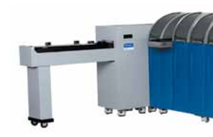
Datacard<sup>®</sup> MXD<sup>™</sup> Lite card delivery system

The MXD Lite card delivery system and the MXi envelope insertion system seamlessly integrate with the MX1100 system to enhance your overall card operations. In one automated process, you can affix cards and add marketing inserts into an envelope for a complete card-to-envelope solution.